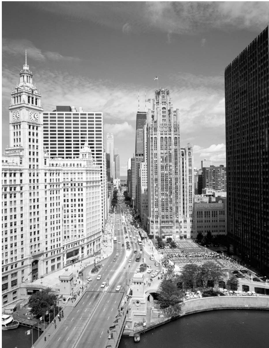
Michigan Avenue, present day.

The MAC spring meeting hotel, the Wyndham Chicago, is located in downtown Chicago at 633 North St. Clair Street (at the intersection of St. Clair and Erie Streets). A block of rooms has been reserved at a special rate of $154 for single and double occupancy, terrific for such a great location! Room rates and availability are guaranteed through March 22. Check-in is 4:00 P.M. and checkout is 11:00 A.M. You can make reservations on-line at < www.wyndham.com/hotels/ORDDT/main.wnt >, or by calling 312-573-0300 or 1-800-996-3426. Be sure to request the Midwest Archives Conference rate.