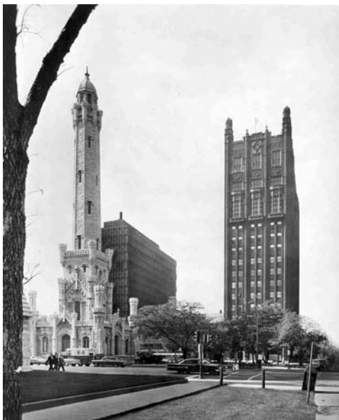
Lewis Towers at Water Tower Campus, c. 1950s.