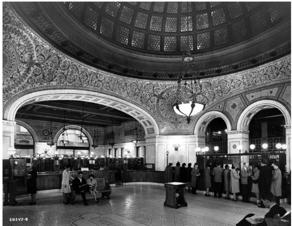
Circulation desk under the world's largest Tiffany dome in the Chicago Public Library (now the Chicago Cultural Center), c. 1940.