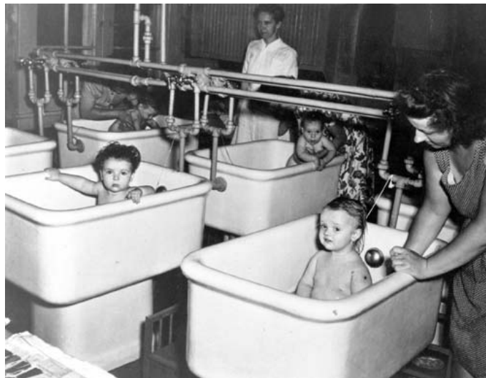
Bath time at the Hull-House Settlement House.