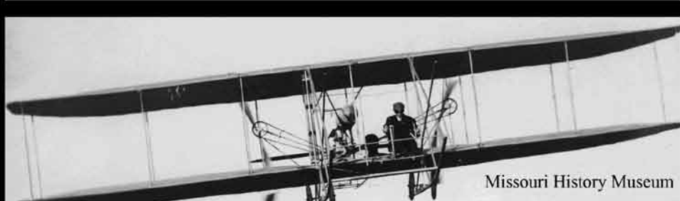
Missouri History Museum