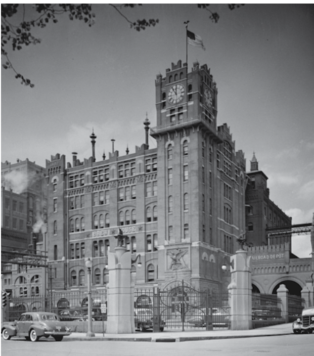
Northwest entrance to the Brewhouse, showing the western railroad depot. Anheuser-Busch Brewery.

Organizing data for eloquent presentation!