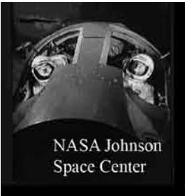
NASA Johnson Space Center