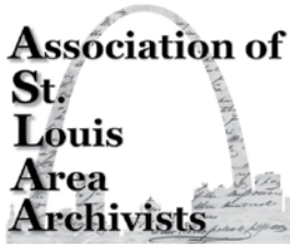
Association of St. Louis Area Archivists

The Midwest Archives Conference wishes to thank the following organizations, individuals, and businesses that, as of press time, have generously provided support for the MAC Annual Meeting, 2009: