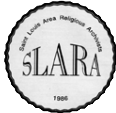
St. Louis Area Religious Archivists Absorene Manufacturing Company Academy of Certified Archivists (ACA) ArcaSearch