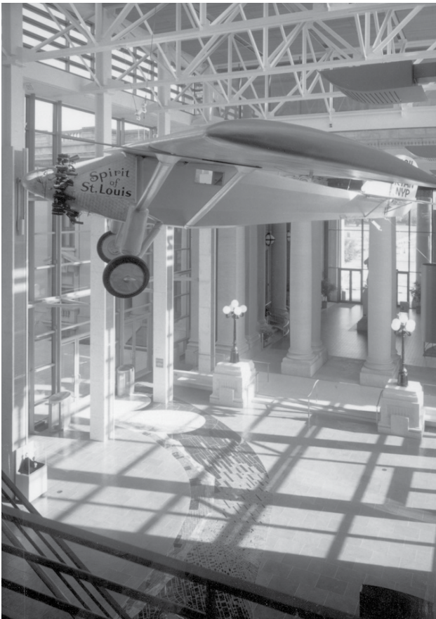
McDermott Grand Hall of Missouri History Museum.