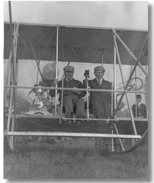
Former President Theodore Roosevelt and pilot Arch Hoxsey preparing for takeoff for Roosevelt's first airplane ride. International Aviation Meet, Kinloch Field. October 11, 1910. Aviation 0095. NS 07161.

To learn more about St. Louis's history please visit the City of St. Louis History & Heritage Web site, at http://stlouis.missouri.org/heritage/index.html .