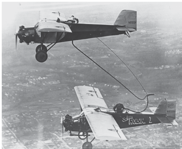
Airplane “St. Louis Robin 1” refueling in midair during an endurance test lasting from 13 July to 30 July 1929. The Robin set an endurance record with 420 hours, 21 minutes, and 30 seconds of continuous flight. Photograph, 1929. Missouri Historical Society Photographs and Prints Collections. Aviation 351. NS 30209.