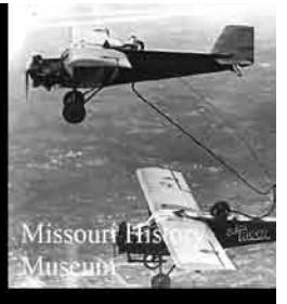
Missouri History Museum