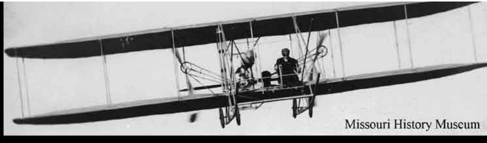
Missouri History Museum