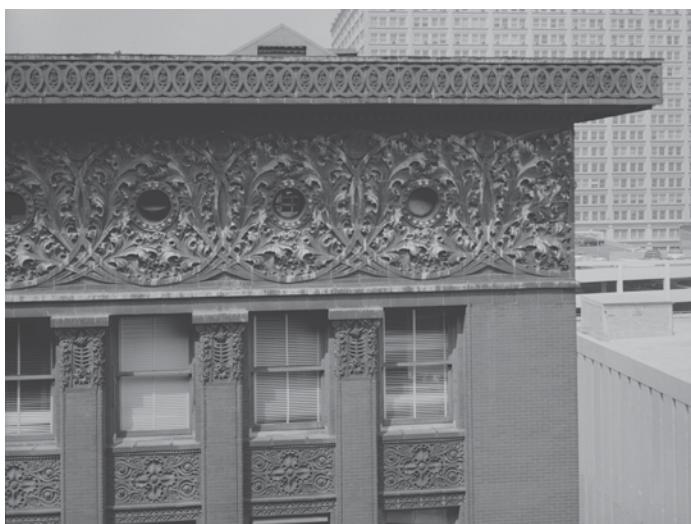
Wainwright Building, designed by Louis Sullivan, constructed 1890–1891.