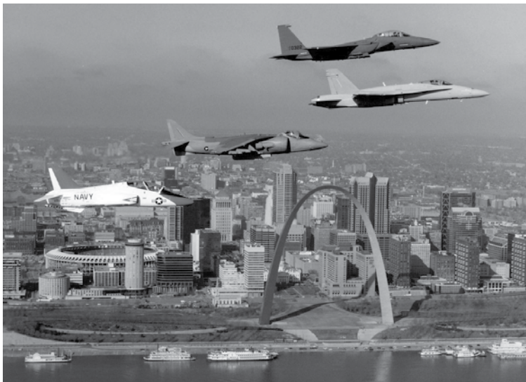
“A Family Reunion over the Gateway Arch.” An F-15 Eagle, an F/A-18 Hornet, an AV-8B Harrier, and a T-45 Goshawk (top to bottom) flying past the Gateway Arch in St. Louis, Missouri. February 10, 1993.