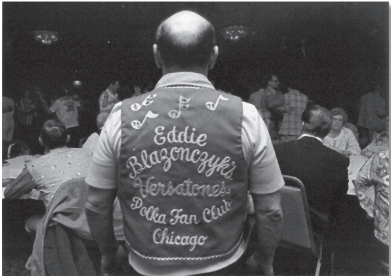
Polka dancer, 1979.