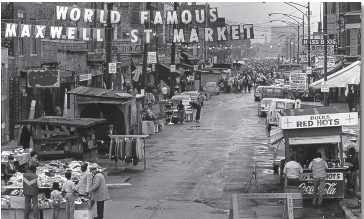
Maxwell Street, 1982.

See the MAC Newsletter and Web site http://www.midwestarchives.org for details!