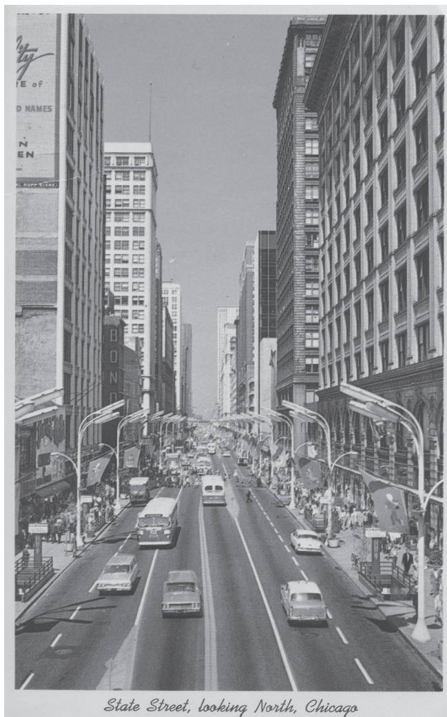
State Street, looking North, Chicago