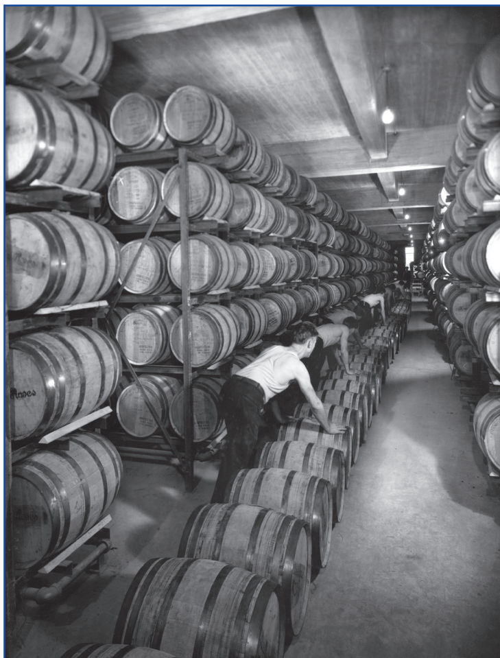
"Bourbon barrels," Louisville, Kentucky, 1935