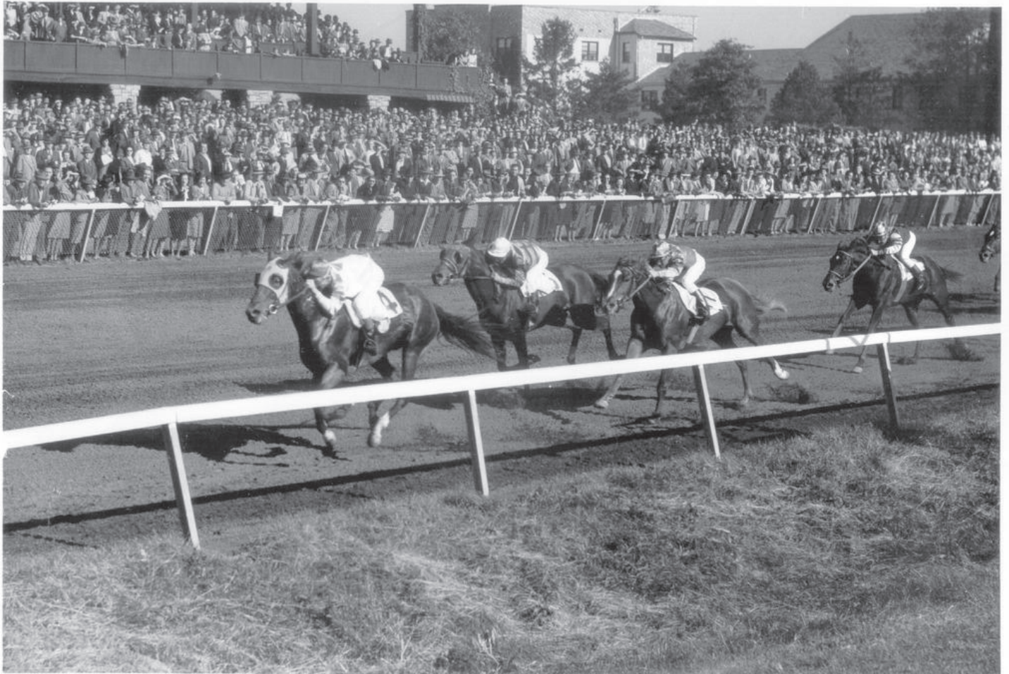
"At the finish, Keeneland,"