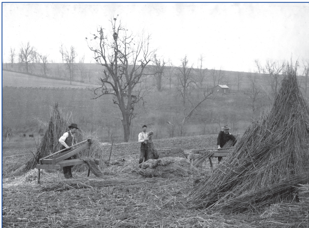
"Harvesting hemp," 1900s