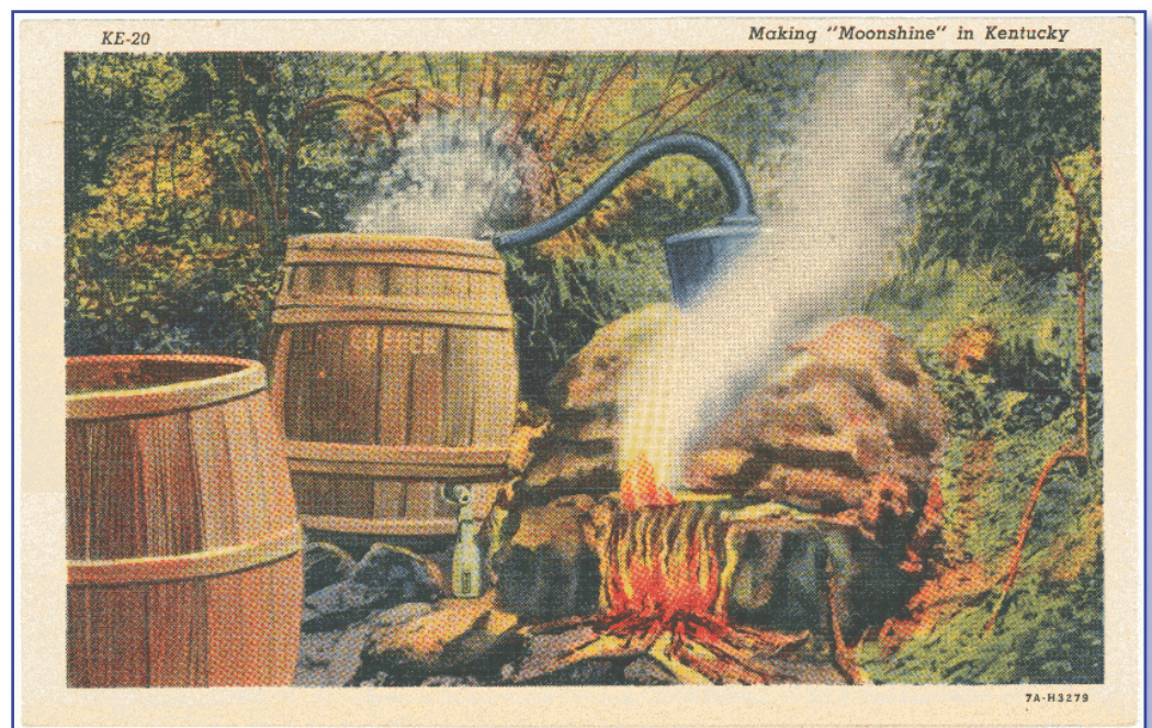
“Making ‘Moonshine’ in Kentucky,”