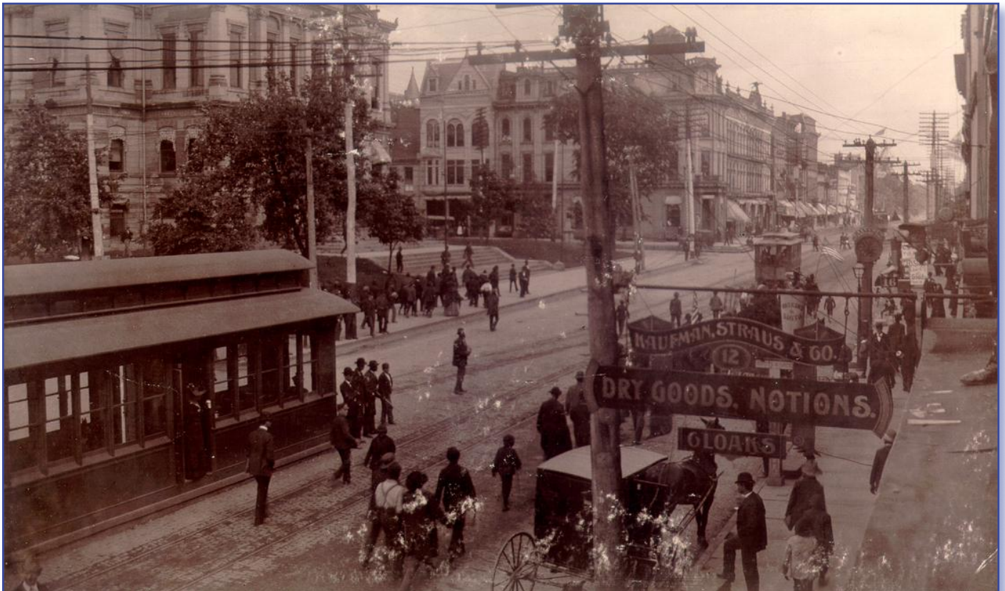
"Main Street, Lexington; Taken near courthouse,"

Representatives from the Kentucky Distillers Association will lead MAC members in a Kentucky bourbon tasting at ArtsPlace. A screening of Kentucky Bourbon Tales: Distilling the Family Business , An Oral History of Kentucky's Signature Bourbon Industry will follow the tasting.