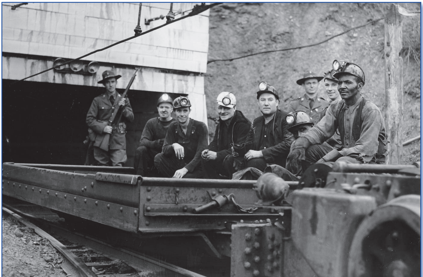
“Miners leaving a mine entrance in a cart with police watching,” 1939, Harlan County Mine Strike Photographic Collection, 81pa109, University of Kentucky Special Collections Research Center