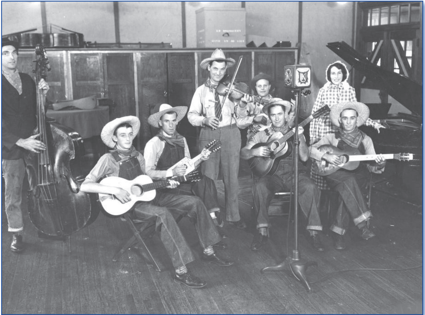
“Country or bluegrass band,”