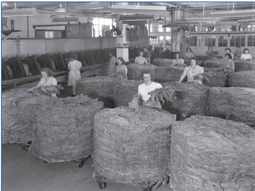
"Women sorting and preparing tobacco at the Brown & Williamson factory," Louisville, 1946