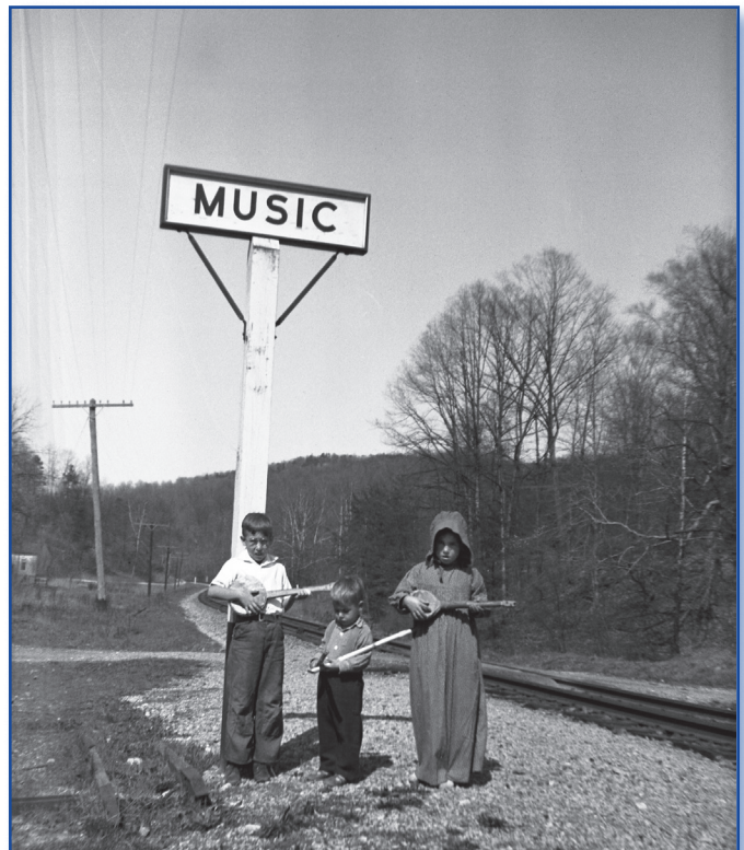
"Young musicians pose by railroad stop at Music, Kentucky,"

The Transit Authority of Lexington (LexTran) offers an express route from Blue Grass Airport to the downtown Transit Center on Vine Street. For maps, fares, schedules, and other information, visit the LexTran website at www.lextran.com/