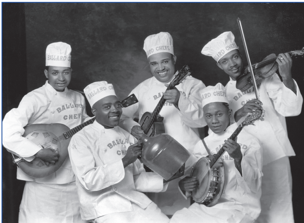
"Ballard Chefs Jug Band," 1932